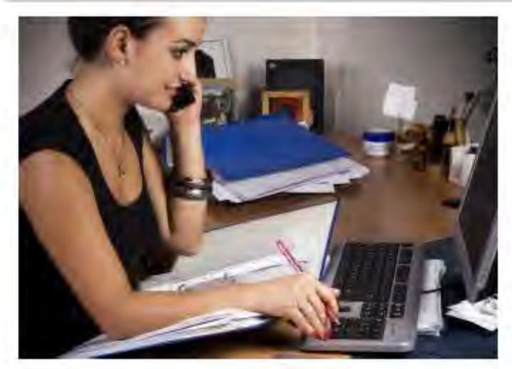
Secretaries and administrative assistants work in offices.

Secretaries and administrative assistants held about 4.0 million jobs in 2016. Employment in the detailed occupations that make up secretaries and administrative assistants was distributed as follows: